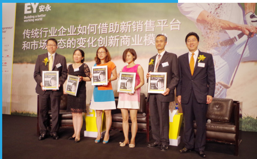
光华成为 2014 “安永企业家大奖”公益合作伙伴 BCF was awarded the Charity Partner of the EY Entrepreneur in 2014.

Bright China Entrepreneurship Education Program won the bronze prize of the 3 rd China Philanthropy and Charity Program Award.