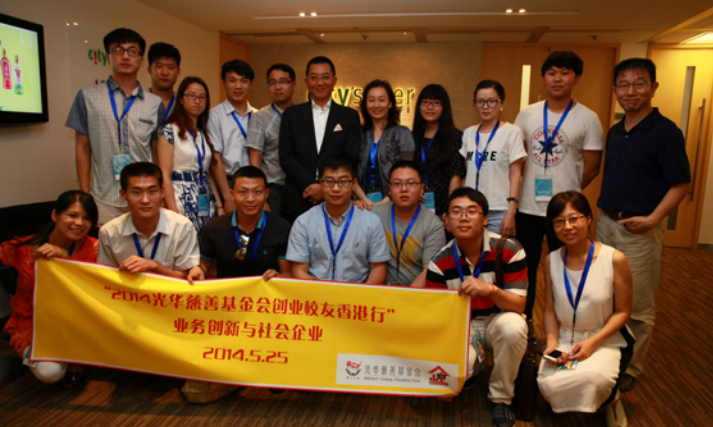
校友参观 City Super 集团 Alumni visiting City Super Group

光华慈善基金会一直致力于为创业校友提供更多的支持和指导，积极探索建立校友服务的模式，发展校友网络平台，打造校友人才库，让更多的校友能够分享经验，共享资源。目前，光华已开展“光华创业精神大奖 (BESA)”、“创业校友联盟”、“创业基金”、“创业专家指导”系列校友服务项目。